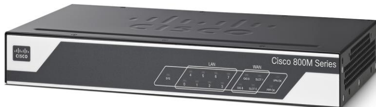
Figure 1. Cisco 800M ISR (C841M-8X)

The Cisco 800M Series platform supports pluggable Cisco WAN Interface Modules (WIMs) for flexible connectivity.