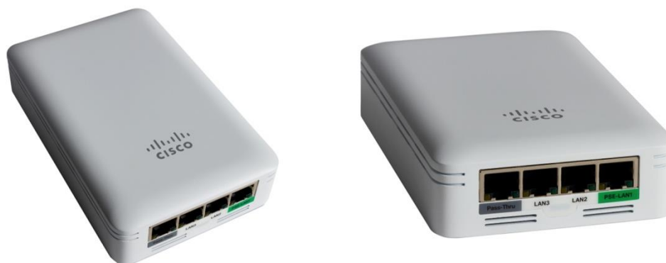
Figure 1. Cisco Aironet 1815w Access Point

Packing 802.11ac Wave 2 wireless standards support and Gigabit Ethernet wired connectivity into a sleek device, the 1815w is built to take full advantage of existing cabling infrastructure while blending into the visual footprint. This combination provides best-in-class performance while reducing total cost of ownership.