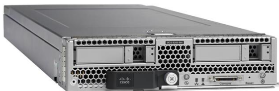
Figure 1. Cisco UCS B200 M4 Blade Server

In addition, Cisco UCS has the architectural advantage of not having to power and cool excess switches, NICs and HBAs in each blade server chassis. Having a larger power budget per blade server provides uncompromised expandability and capabilities, as in the new Cisco UCS B200 M4 server with its leading memory-slot and drive capacity.