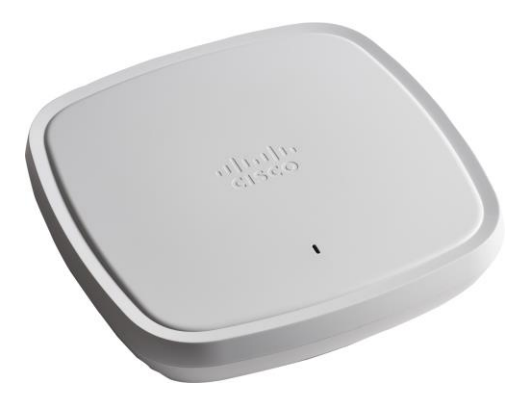
Figure 1. Cisco Catalyst 9115AX Series

The Cisco<sup>®</sup> Catalyst<sup>®</sup> 9115AX Series with Wi-Fi 6is the next generation of enterprise access points. They are resilient, secure, and intelligent.